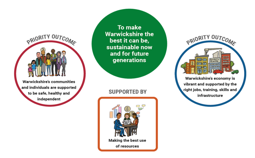
Figure 2: The Council's Core Purpose and Priority Outcomes

The Annual Governance Statement provides assurances that these processes are working in practice and provide services in line with our priorities by delivering on our supporting priority of Making the Best Use of Resources.